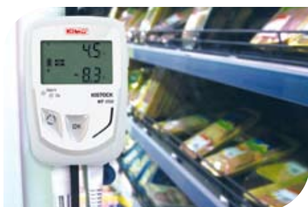
Cold chain monitoring