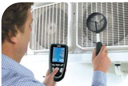
Air conditioner control

Ensure the correct operation of heating, ventilation and refrigeration installations, to improve comfort and reduce energy over consumption.