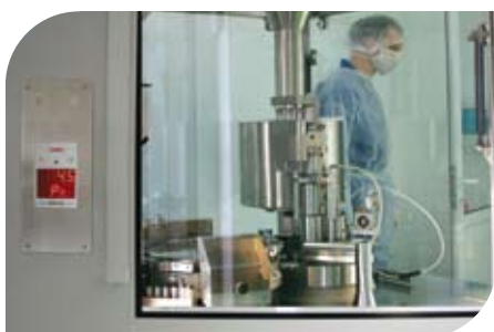
Clean room monitoring