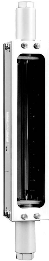
Model 1110 Full-View Flowmeter (NPT Connections)