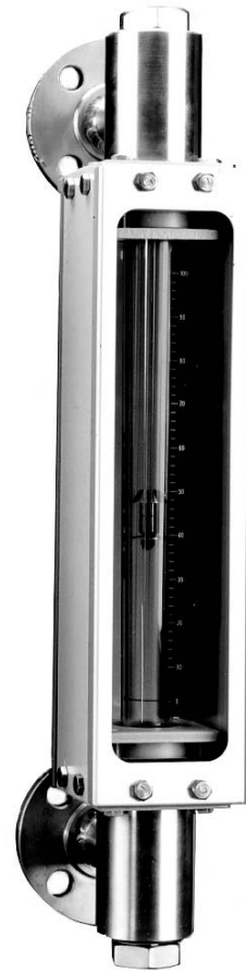
Model 1140 Full-View Flowmeter (Flange Connections)